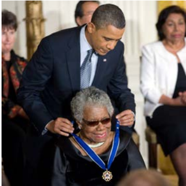
President Barack Obama presenting Angelou with the Presidential Medal of Freedom, 2011